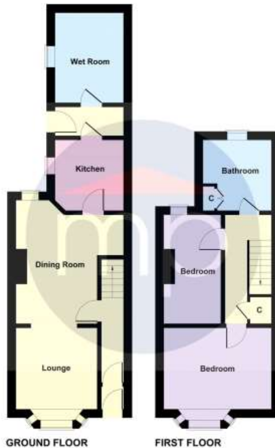
Not to Scale. Produced by The Plan Portal 2024 For Illustrative Purposes Only.

The information provided about this property does not constitute or form part of an offer or contract, nor may it be regarded as representations. All interested parties must verify accuracy and your solicitor must verify tenure and lease information, fixtures and fittings and, where the property has been recently constructed, extended or converted, that planning/building regulation consents are in place. All dimensions are approximate and quoted for guidance only, as are floor plans which are not to scale, and their accuracy cannot be confirmed. Reference to appliances and/or services does not imply that they are necessarily in working order or fit for the purpose. We offer our clients an optional conveyancing service, through panel conveyancing firms, via MWU and we receive on average a referral fee of one hundred and thirty pounds, only on completion of the sale. If you do use this service, the referral fee is included within the amount that you will be quoted by our suppliers. All quotes will also provide details of referral fees payable.